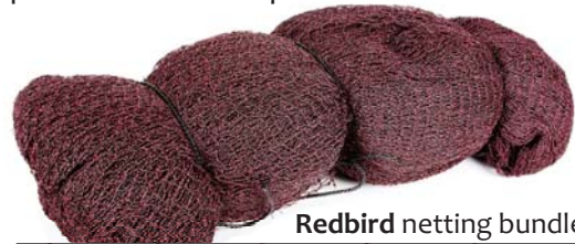
Redbird netting bundle

Heavy duty construction and durability make the Redbird Fire Retardant Bird Netting perfect for all types of exclusion projects especially in areas that require fire retardant products.